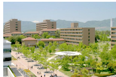
Higashi-Hiroshima campus (Hiroshima University)

For international students, please contact student Support Office at info@thunderbird-tokyo.jp .